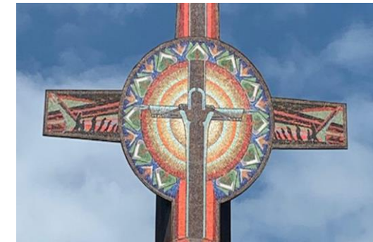
The Tower of the Four Winds, designed by Lutheran pastor F. W. Thomsen, was rededicated Oct. 2019 at Black Elk-Neihardt Park in Blair, Neb.

When you turn to the Lord and follow Jesus can you learn something new every day? Is the Lord giving you something new?